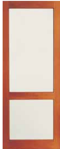
Macquarie 2 Lite