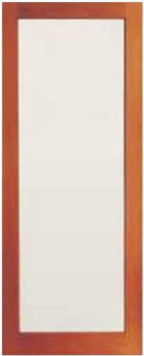
Macquarie 1 Lite