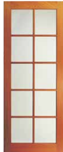
Macquarie 10 Lite