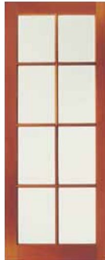
Macquarie 8 Lite